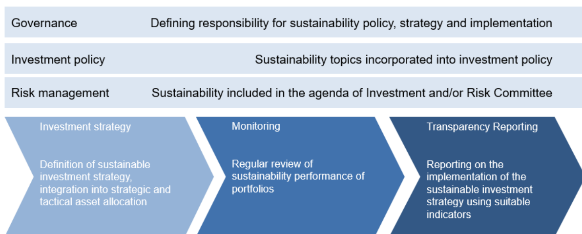
Figure 1: Integration of Sustainability into different elements of the investment process

A sustainable investment process (used in these recommendations as a synonym for responsible investment and ESG investing) contains similar elements to a normal investment process. The following chart provides an overview of the different elements of a sustainable investment process. The subsequent chapters are essentially organised along this order: